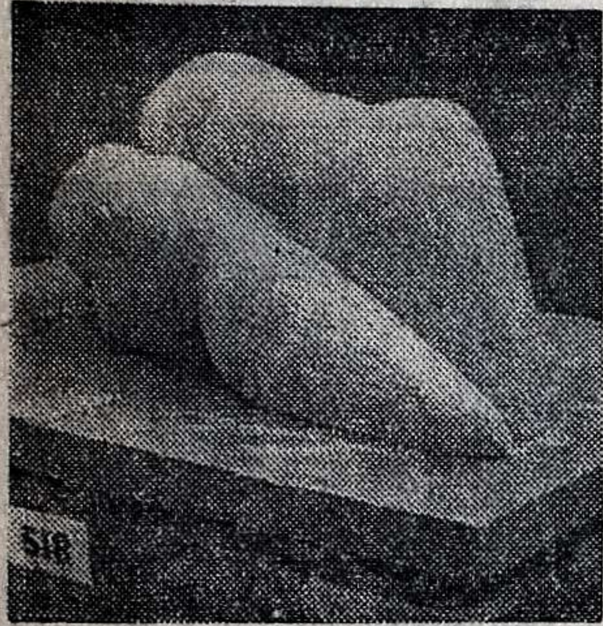
"In the sun"